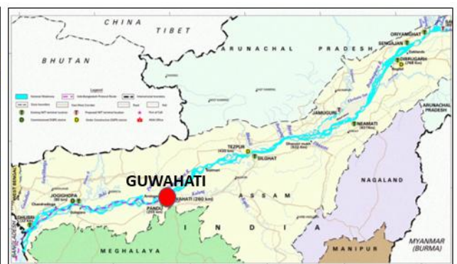
LOCATION OF GUWAHATI ON NW-2

Note: Bidders may do assessment of the terminal locations for Geotechnical investigations by own before bidding