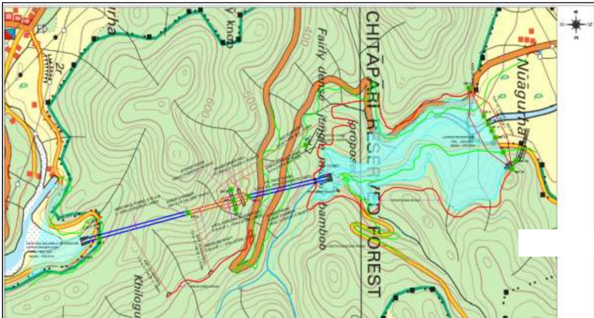
Fig. - 2 : Project Layout on Survey of India Topographic Map