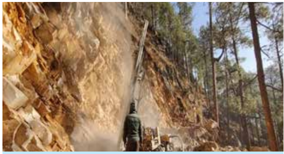
Hill side cutting work in progress