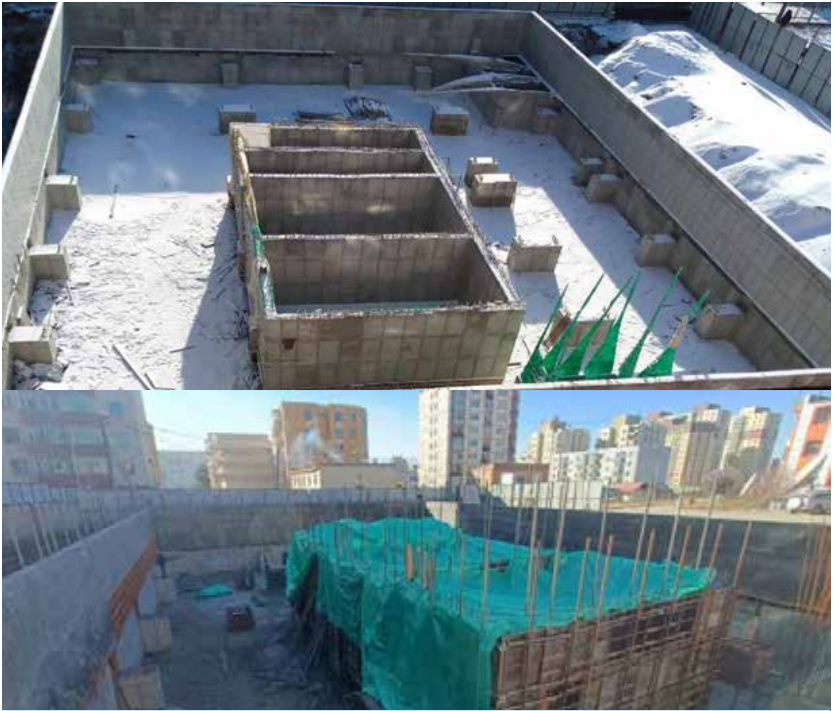
Main Building Sub Structure above the Raft Foundation upto (+) 0.85 Lvl including Retaining wall Pedestals (-)3.75 Lvl, Water Tanks upto (-) 0.85 Lvl, Service Lift and Passenger Lifts

In Package - 2, LIT submitted the 5 (English) + 1(Mongolian) Copies of Curriculum Development Training Courses (15 out of 16) as per BOQ 5.02 to MUST/ MEDS. LIT completes the following 10 courses out of 16 courses in the first phase of the online training program against BOQ 5.02 as per the new training timelines proposed by the MUST working group.