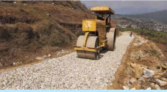
Laying and Compacting of GSB Layer